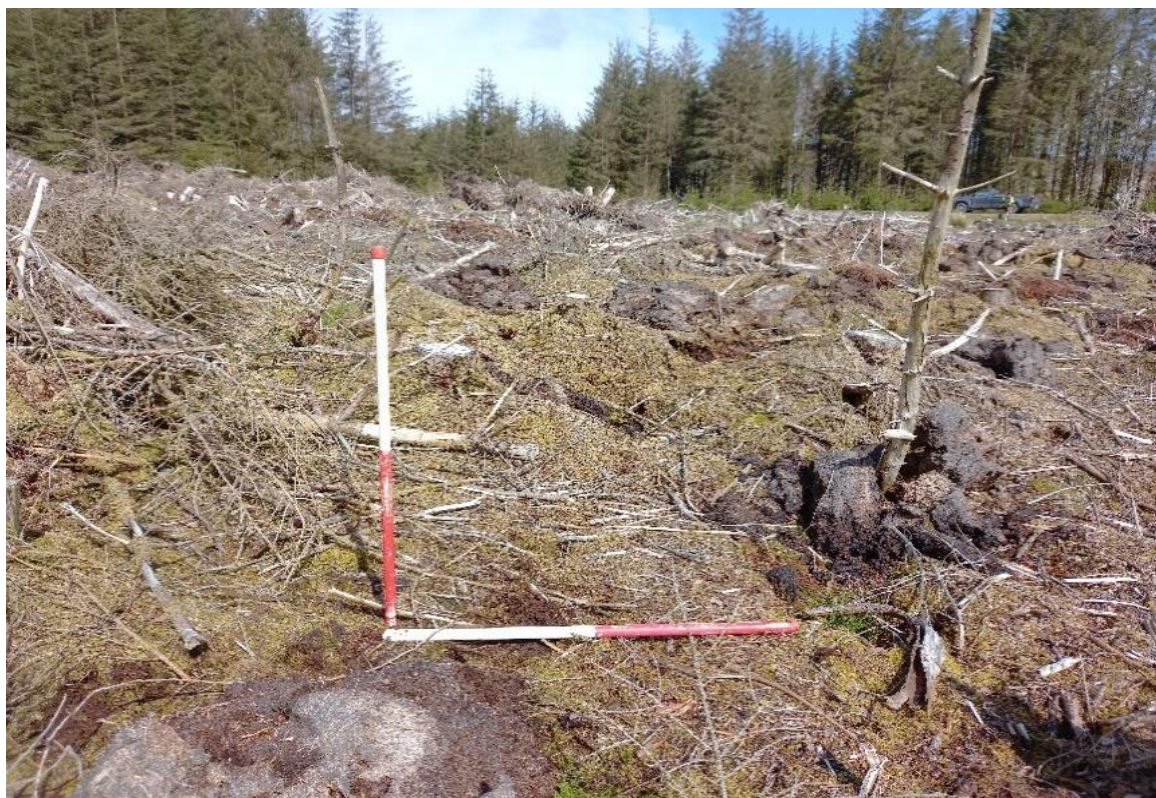
Plate 4 Proposed location of Turbine 7, associated crane hardstanding, assembly area and turning head as shown in Figure 14-1