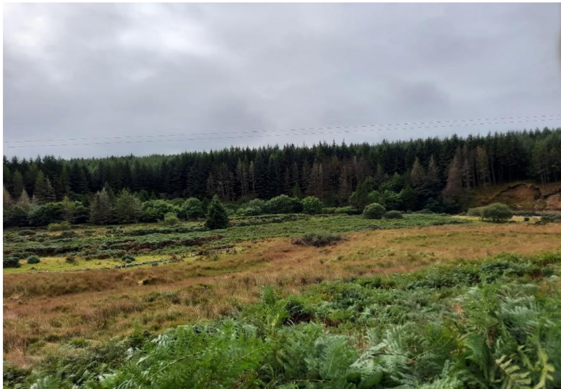
Plate 26 Figure 1 View to the Proposed Development boundary from within the Paps Archaeological Landscape facing south toward Proposed Development Site as shown in Figure 14-1