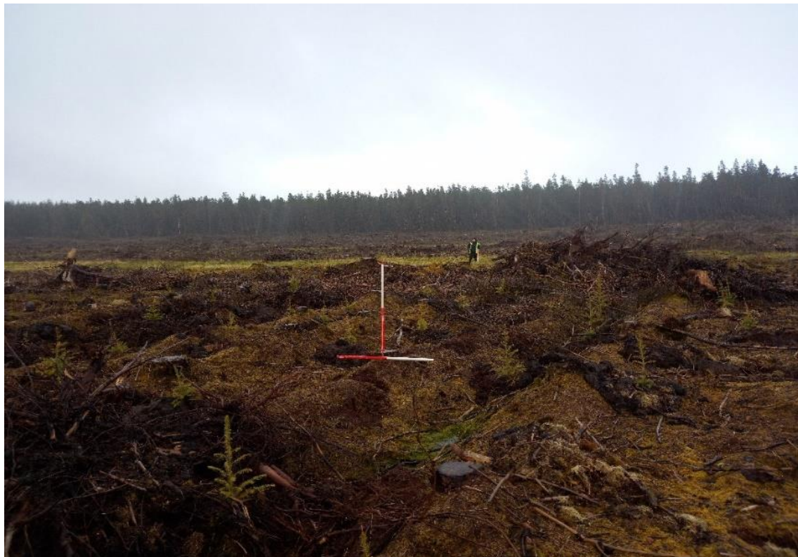
Plate 11 Proposed location of Turbine 17, associated crane hardstanding, assembly area and turning head as shown in Figure 14-1