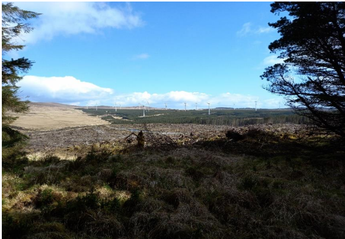
Plate 27 View from Proposed Development Site to the northeast towards adjacent Curragh/Coomacheo Windfarm as shown in Figure 14-1