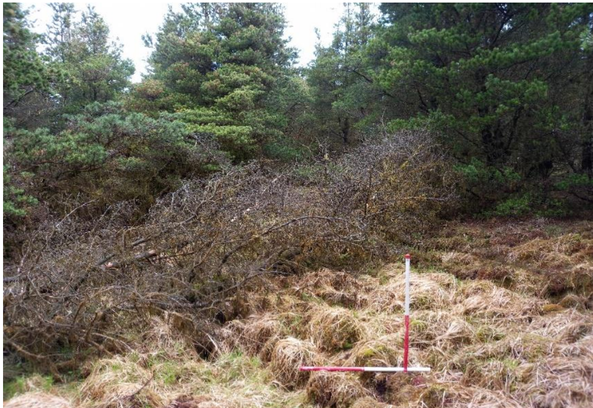
Plate 10 Proposed location of Turbine 16, associated crane hardstanding, assembly area and turning head as shown in Figure 14-1