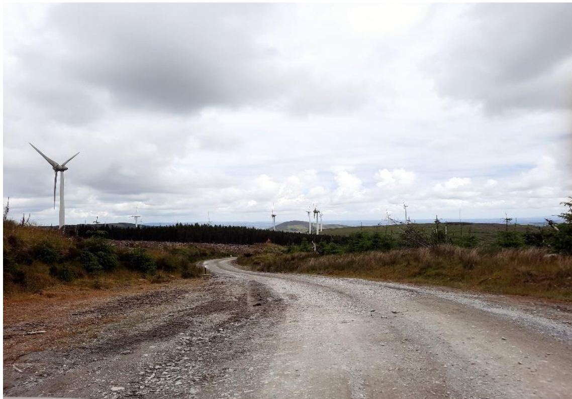
Plate 16 View of part of the on-road section of the grid cable connection route in the townland of Cummeennabuddoge as shown in Figure 14-1