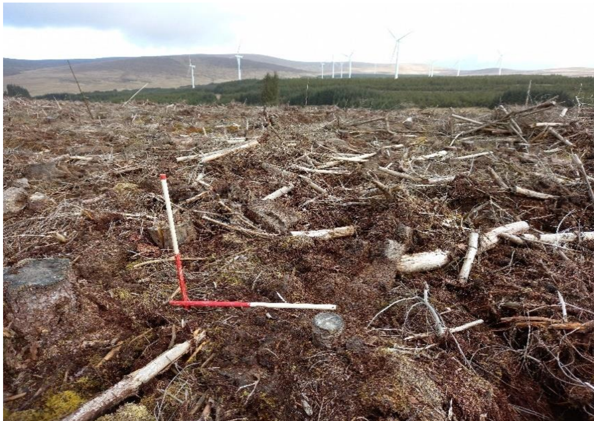
Plate 2 Proposed location of Turbine 2, associated crane hardstanding, assembly area and turning head as shown in Figure 14-1