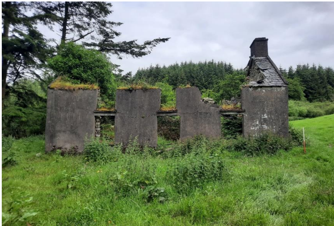
Plate 15 Location of a field system with a single ruinous vernacular structure (CH078) marked on the First Edition Ordnance Survey Sheet. The vernacular structure will not be directly impacted as shown in Figure 14-1