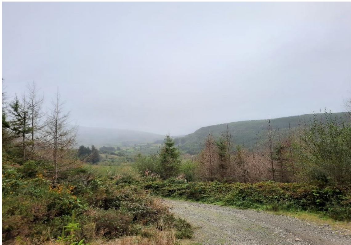
Plate 25 Figure 1 View from 'The Paps' trailhead in the Paps Archaeological Landscape facing east toward Proposed Development Site as shown in Figure 14-1