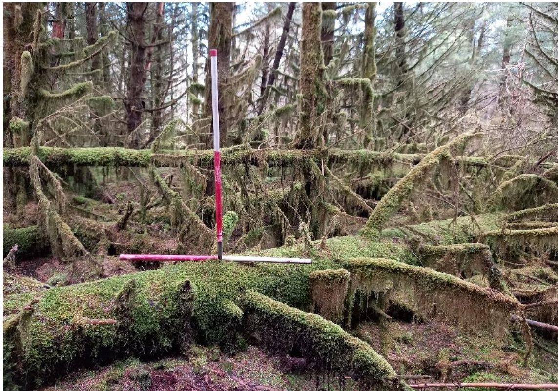
Plate 18 Compound 1 proposed location as shown in Figure 14-1