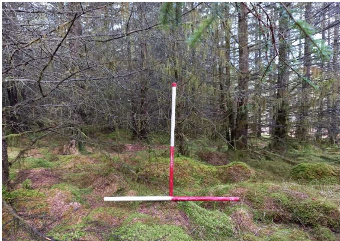
Plate 9 Proposed location of Turbine 15, associated crane hardstanding, assembly area and turning head as shown in Figure 14-1