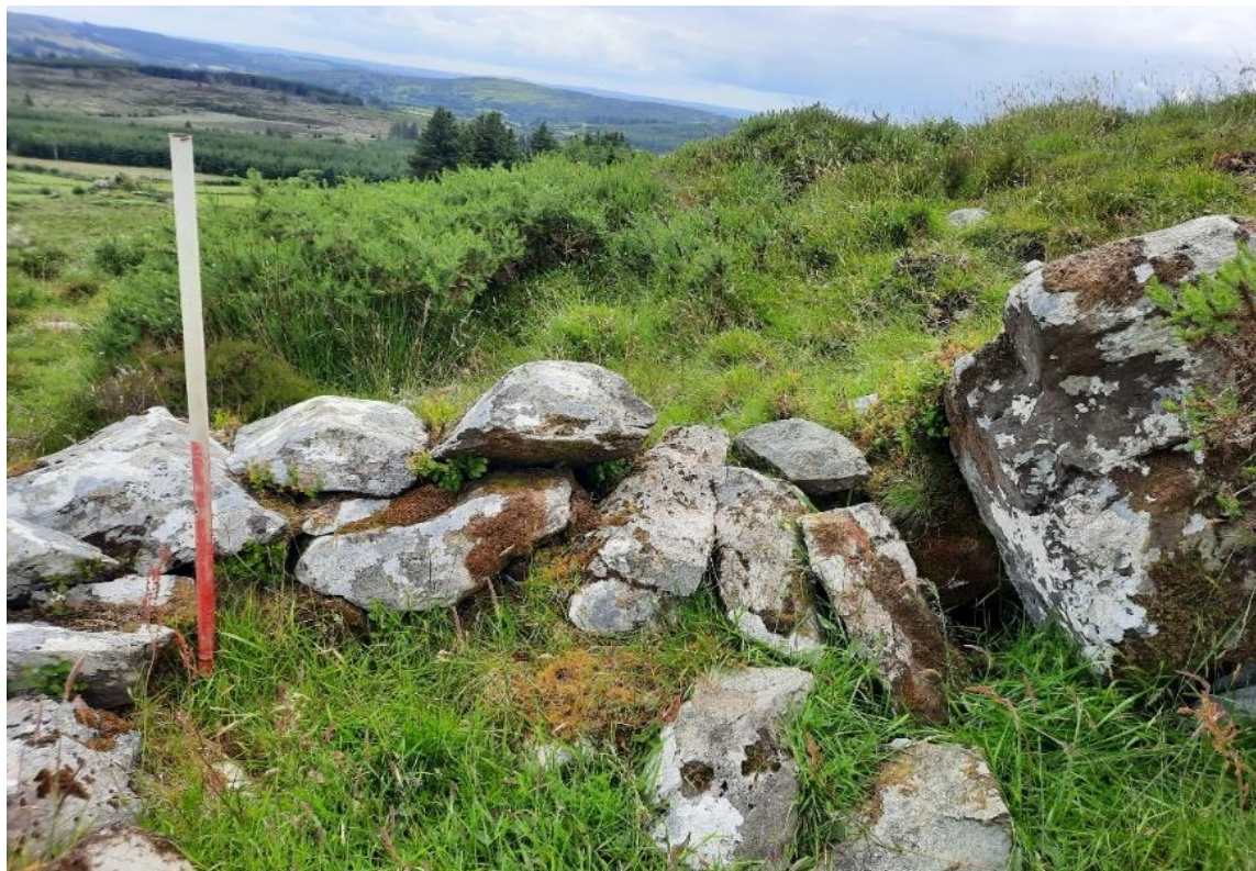
Plate 17 CH081 - A possible hut site located 120 m to the south of the proposed off-road grid cable connection route as shown in Figure 14-1