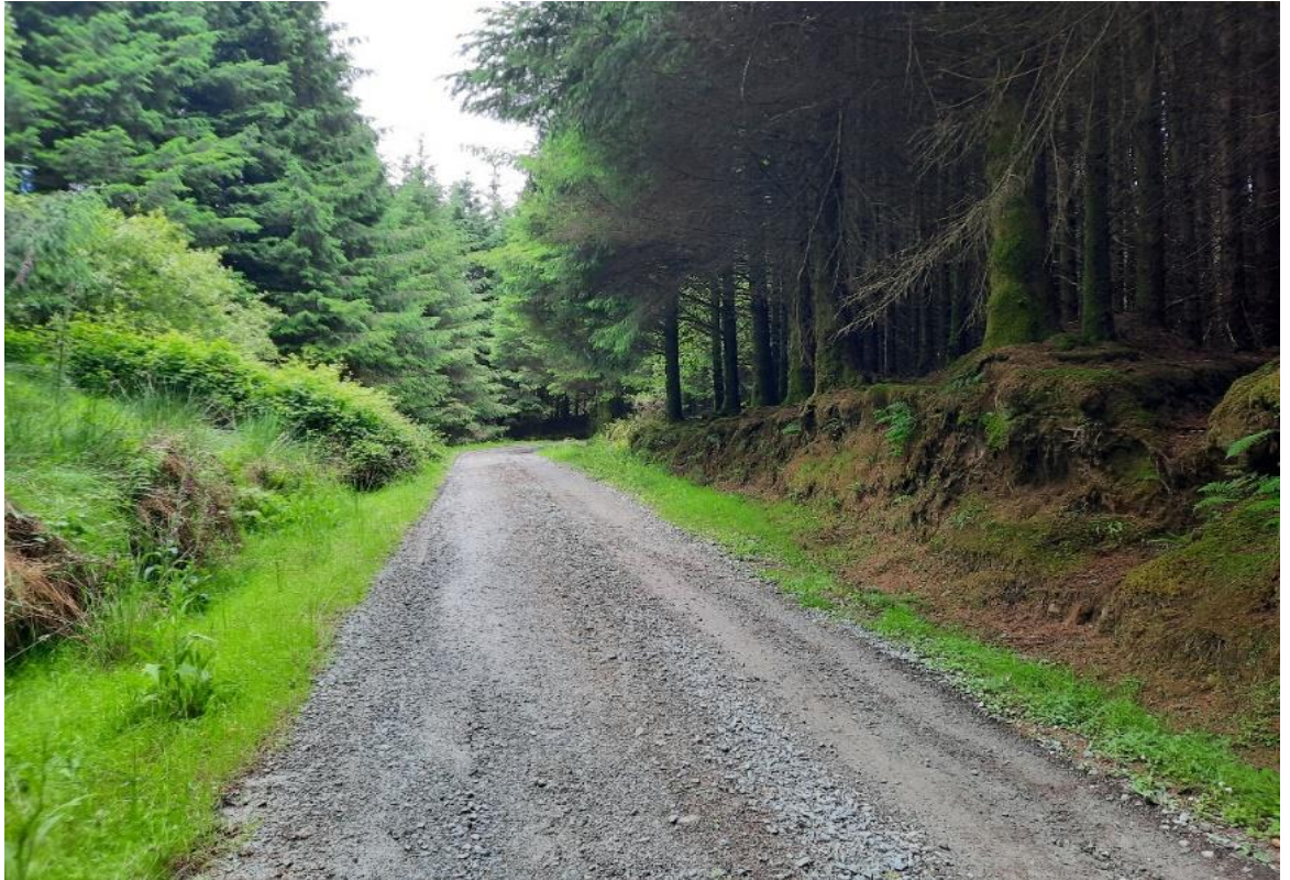
Plate 12 Proposed delivery access route on existing forest road as shown in Figure 14-1