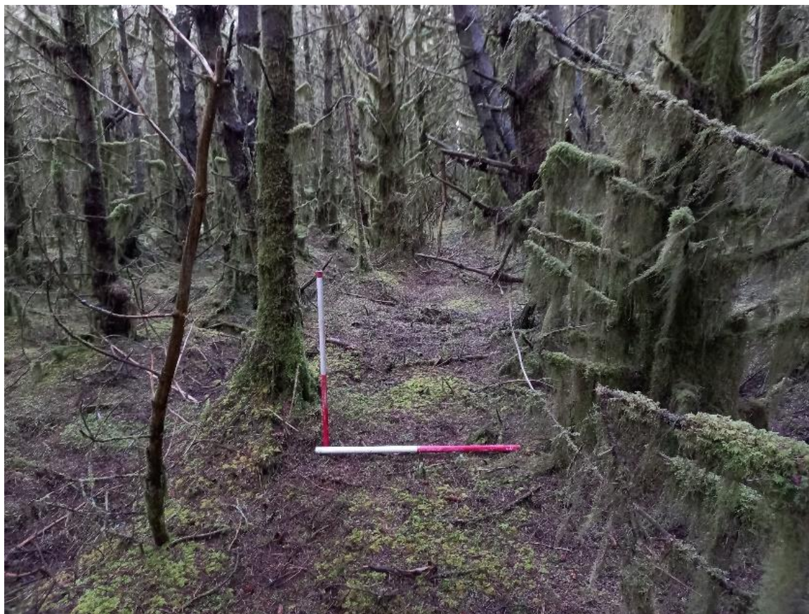
Plate 1 Proposed location of Turbine 1, associated crane hardstanding, assembly area and turning head as shown in Figure 14-1