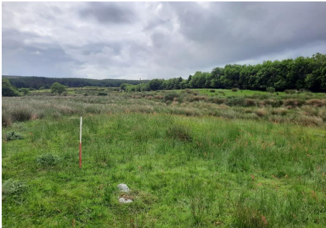
Plate 13 View of CH075 (KE076-086----; ) located to the west of delivery access route as shown in Figure 14-1