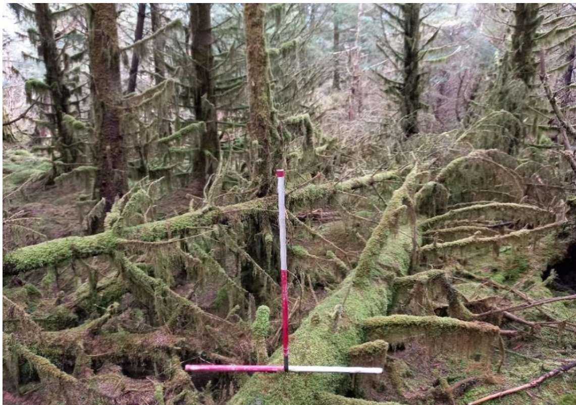
Plate 3 Proposed location of Turbine 3, associated crane hardstanding, assembly area and turning head as shown in Figure 14-1