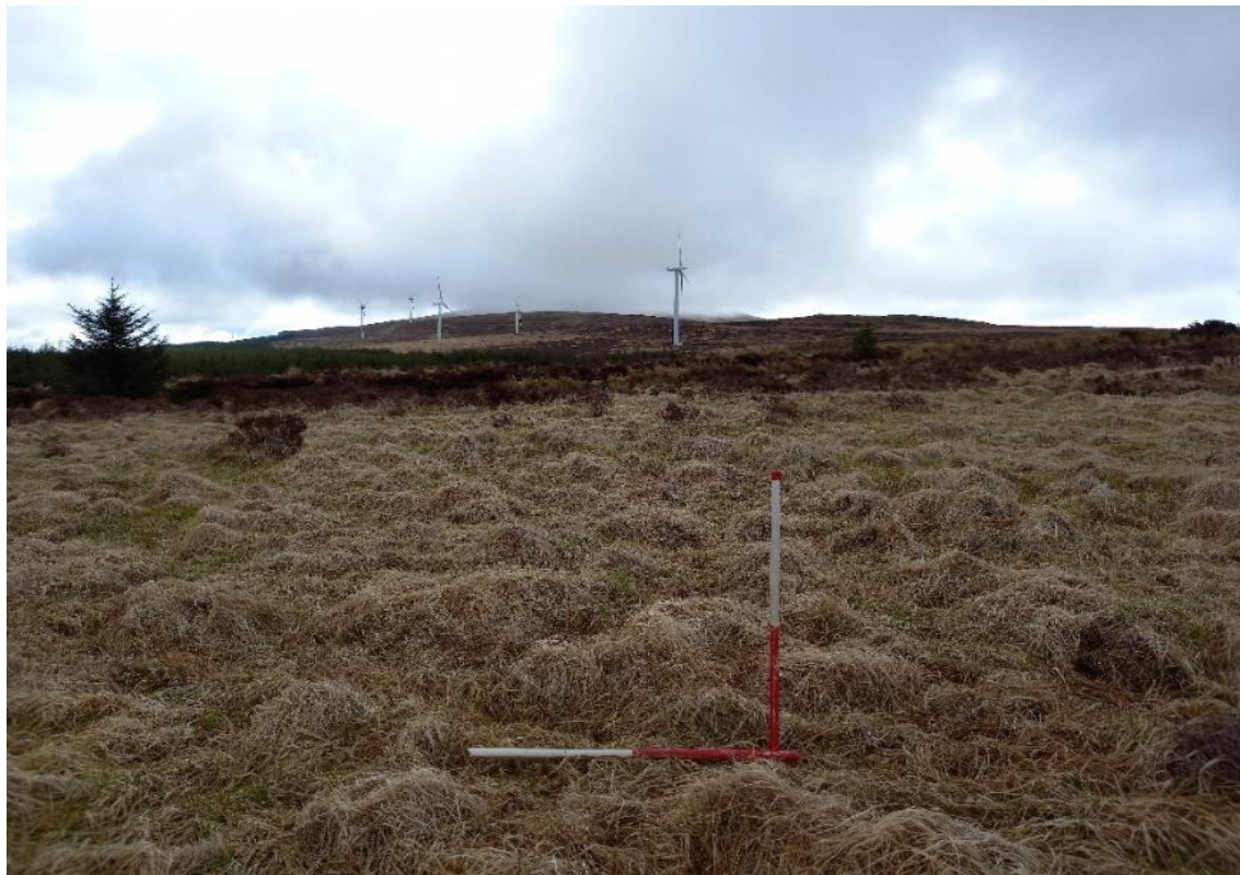
Plate 8 Proposed location of Turbine 14, assembly area and associated crane hardstanding as shown in Figure 14-1