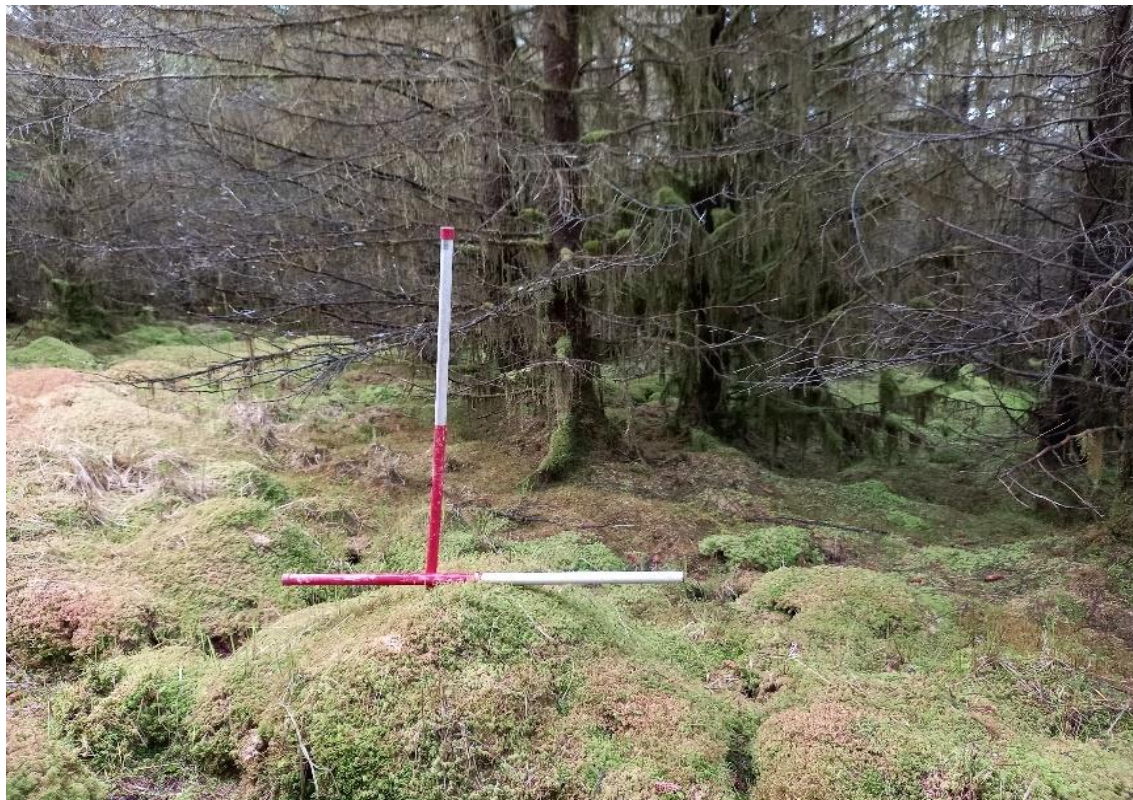
Plate 19 Compound 2 Proposed site location as shown in Figure 14-1