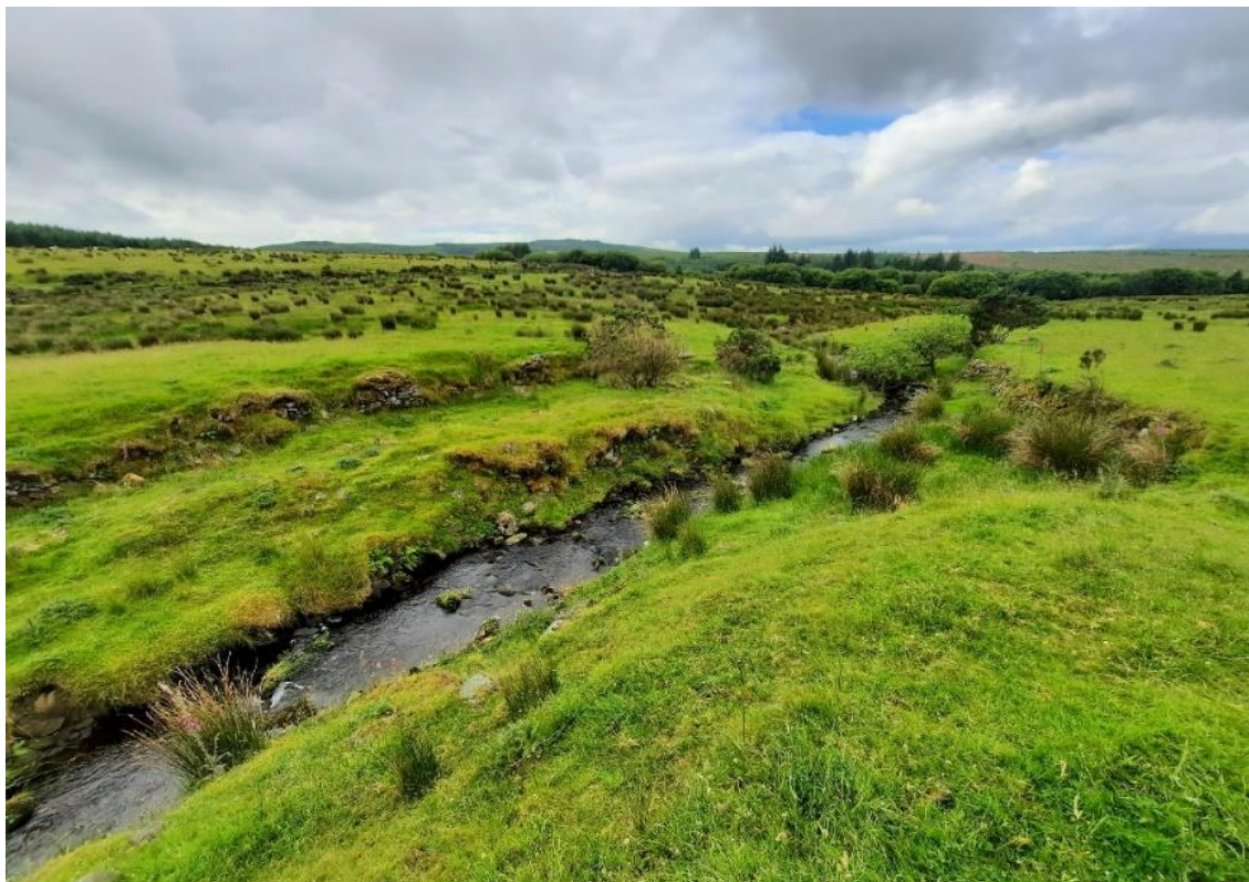
Plate 14 CH080 along CH079 - the Remains of dry stone structure at river crossing along the original route of the N22 as shown in Figure 14-1