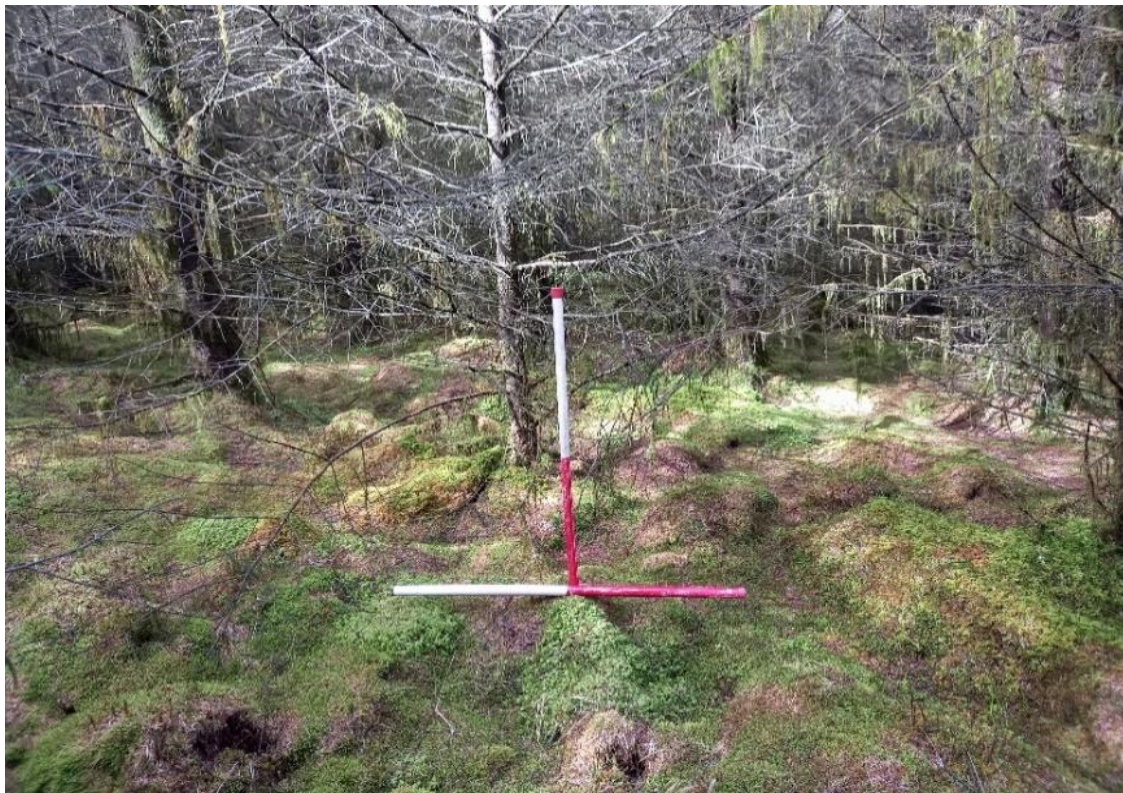
Plate 7 Proposed location of Turbine 13, associated crane hardstanding, assembly area and turning head as shown in Figure 14-1