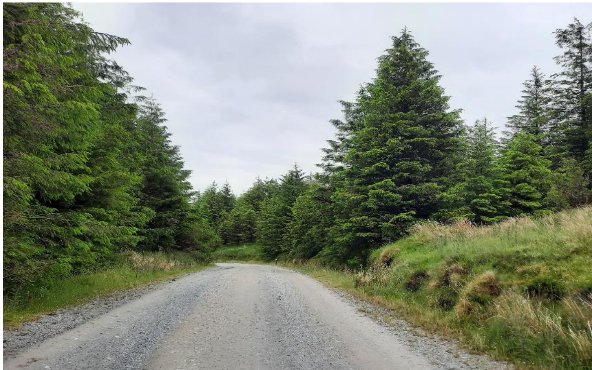
Plate 21 view of location of proposed substation adjacent to existing forestry road as shown in Figure 14-1