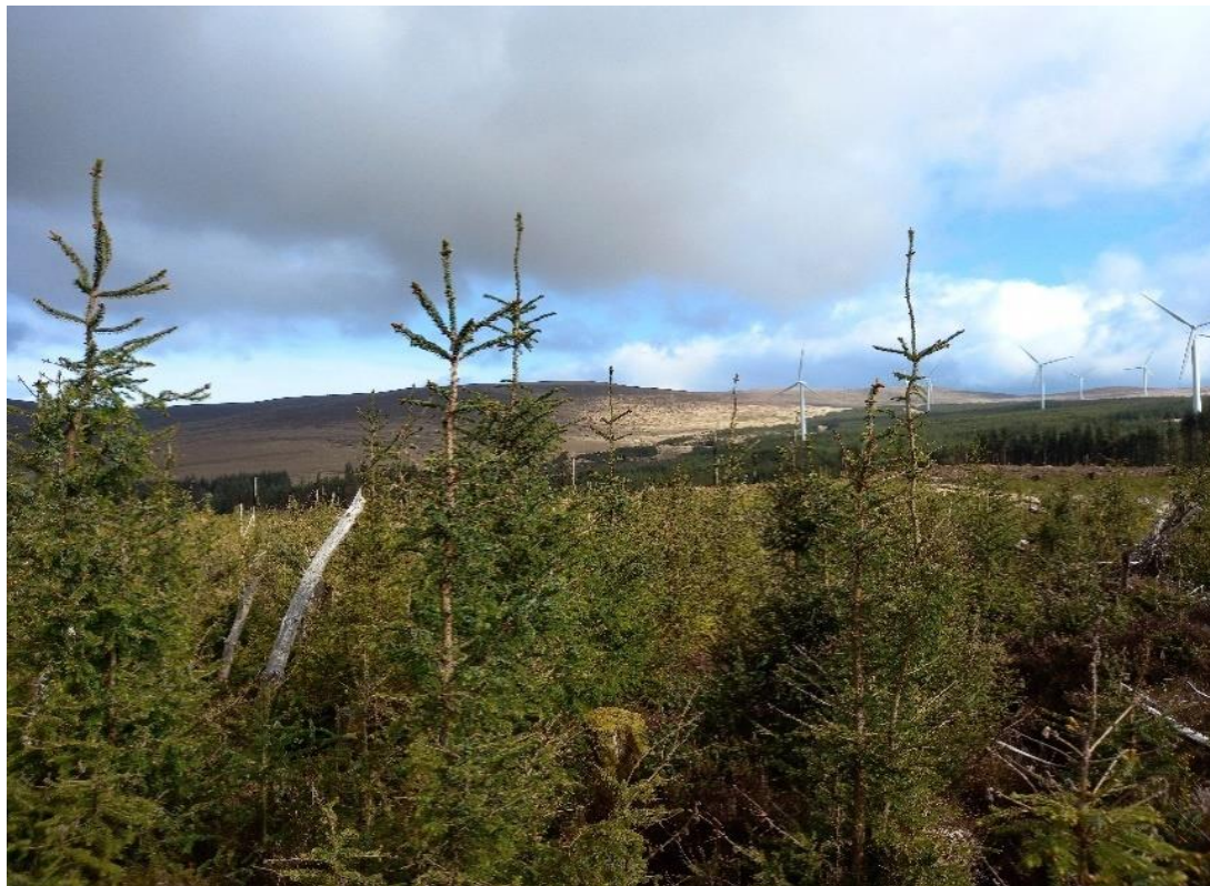
Plate 2 Proposed location of Turbine 5, associated crane hardstanding, assembly area and turning head as shown in Figure 14-1