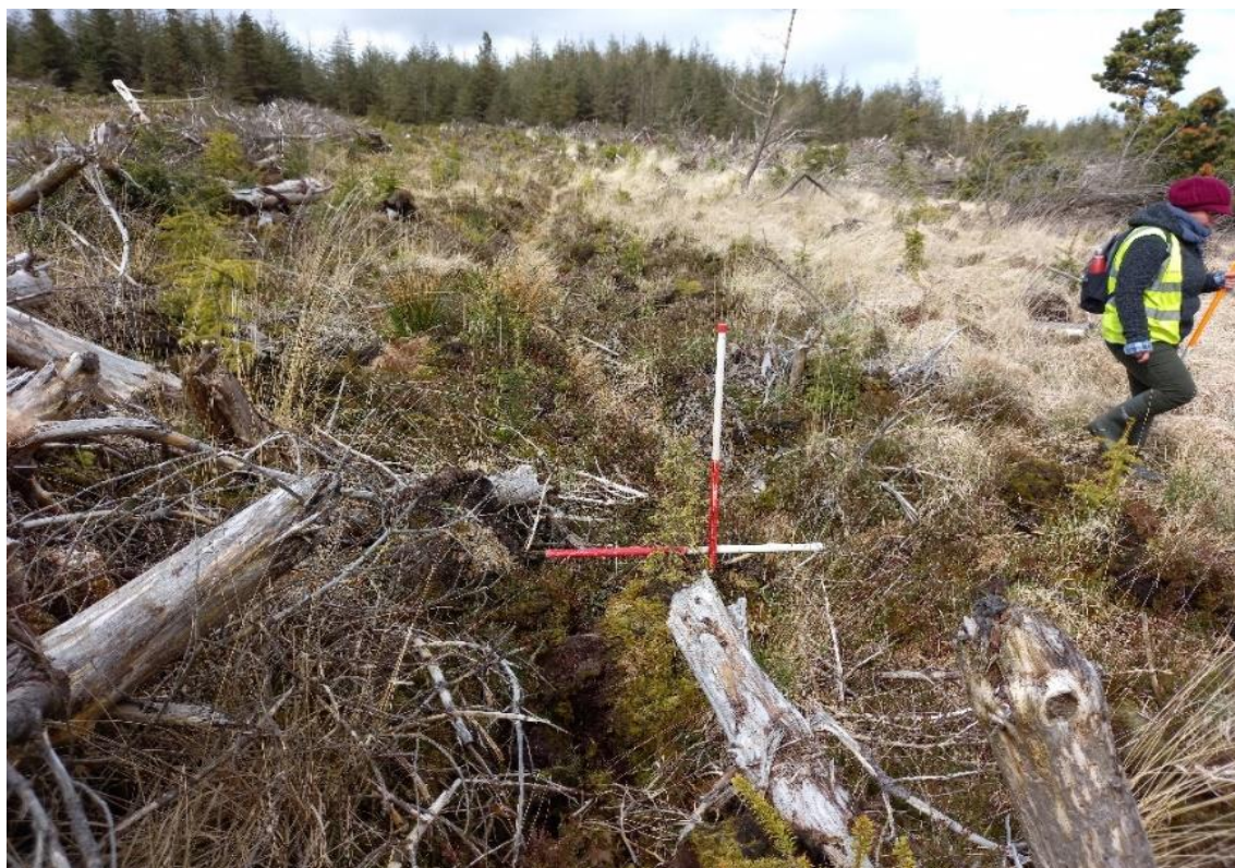
Plate 3 Proposed location of Turbine 6, associated crane hardstanding, assembly area and turning head as shown in Figure 14-1