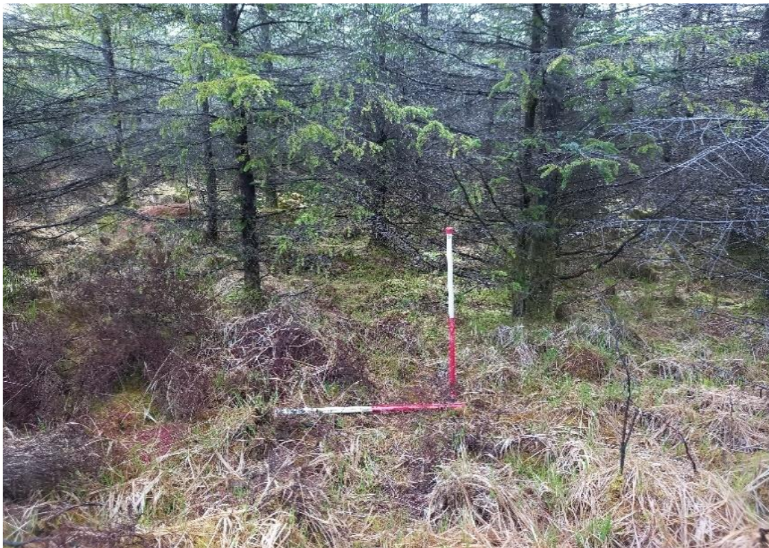
Plate 6 Proposed location of Turbine 10, associated crane hardstanding, assembly area and turning head as shown in Figure 14-1