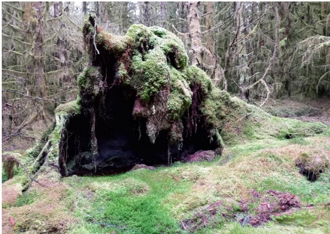
Plate 4 Proposed location of Turbine 4, associated crane hardstanding, assembly area and turning head as shown in Figure 14-1